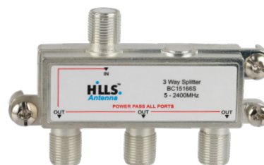
3 Way Splitter