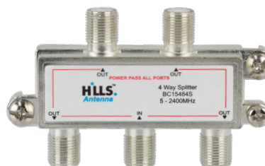
4 Way Splitter