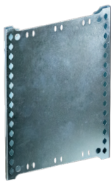
Mounting Bracket - Full Plate