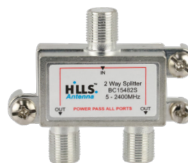
2 Way Splitter