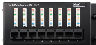
CAT6 Data Module