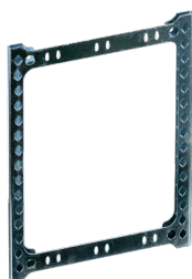
Mounting Bracket - Open Frame