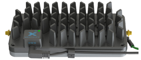
CEL-FI ROAM R41